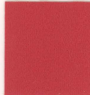
SUEDE FIRE RED