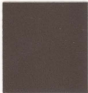
SUEDE DONEGAL PEAT